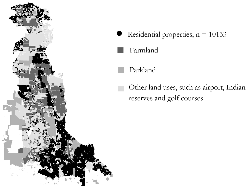
Figure 2 Land use and location of residential properties on the Saanich Peninsula.

Finally, the number of observations was reduced due to the spatial dependence in the model. In order to construct the spatial weighting matrix, properties cannot be incorporated in the analysis more than once. Therefore, if a property is sold more than once during 2000 to 2006, only the most recent transaction is included in the analysis. This refinement led to a total of 10,133 observations. The locations of these properties are indicated in Figure 2, which also shows the locations of parks and farmland on the peninsula. Because our data span seven years, we had to adjust prices, assessed values, GDP and interest rates for inflation. We used the Consumer Price Index (CPI) to make the appropriate adjustments as others have done in this situation (e.g. Cho, et al. (2006)).